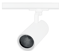
Point LED Shutter honeycomb Pieces in set: 1